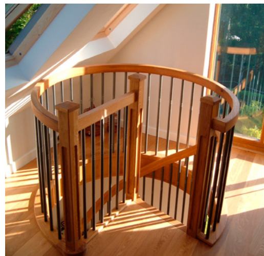
Full Circular Balustrade with Panelled Square Newels