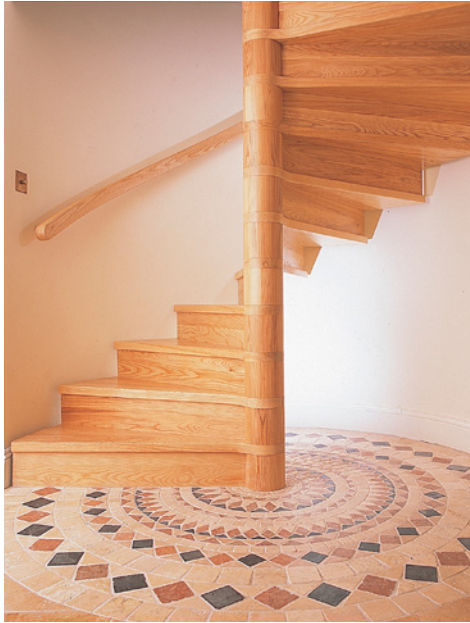
Ash Burke Style Staircase