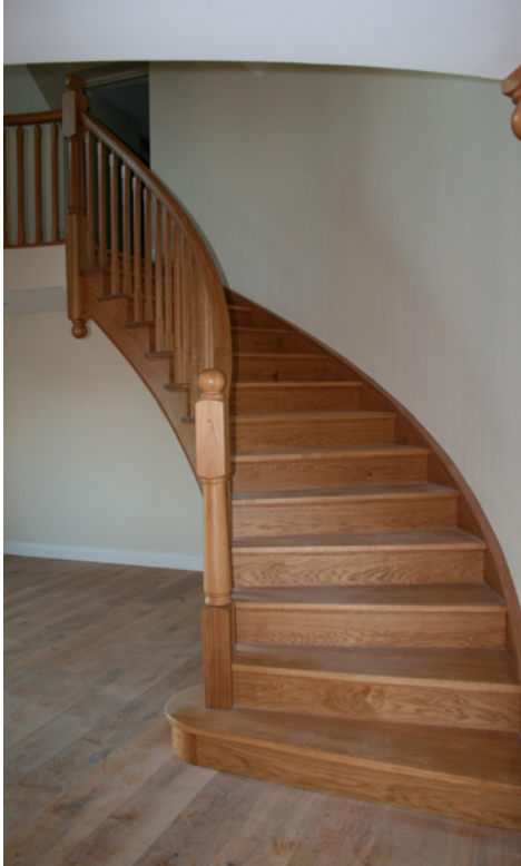
Oak Helical Staircase with Bullnose Bottom Tread