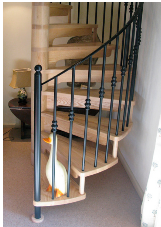
Solid Ash Spiral with Metal Balustrade and Metal Handrail