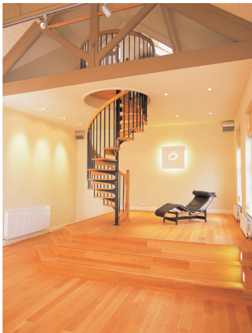
Scandinavian Spiral with Wooden Handrail