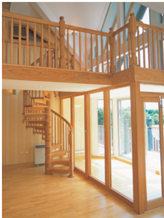
Solid Timber Spiral with Ringed Centre Column and Balusters

For a truly stunning staircase, look no further than our handcrafted, twisted column spiral stairs. The handcrafted design of the central column creates a sweeping feeling and is made in one piece to keep fixings hidden.