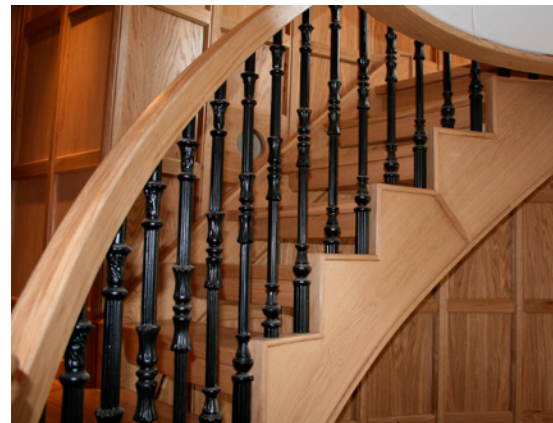
Helical Staircase with Victorian Cast Balusters