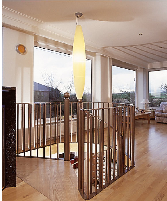
Matching Balustrade can be supplied with any staircase