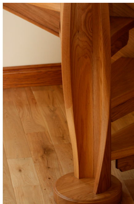
Twisted Centre Column