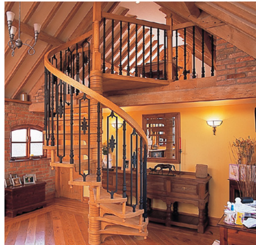
Solid Timber Spiral with Victorian Balusters and Infill Panels