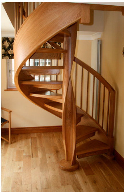
Twisted Column Spiral with Solid Side String