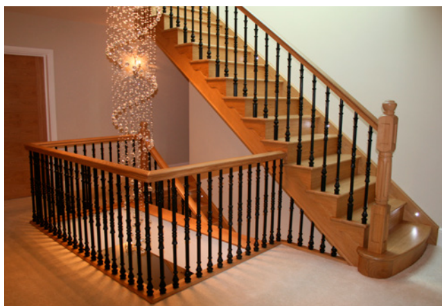
Straight Staircase with Victorian Cast Balusters

All handcrafted by our own team, these staircases make a real feature to anyone's home.