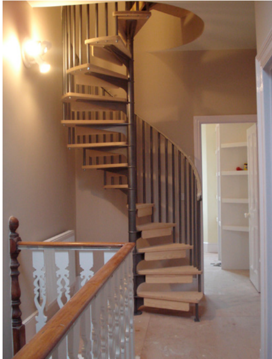
Scandinavian Spiral with Metal Handrail and Timber Riser Bars