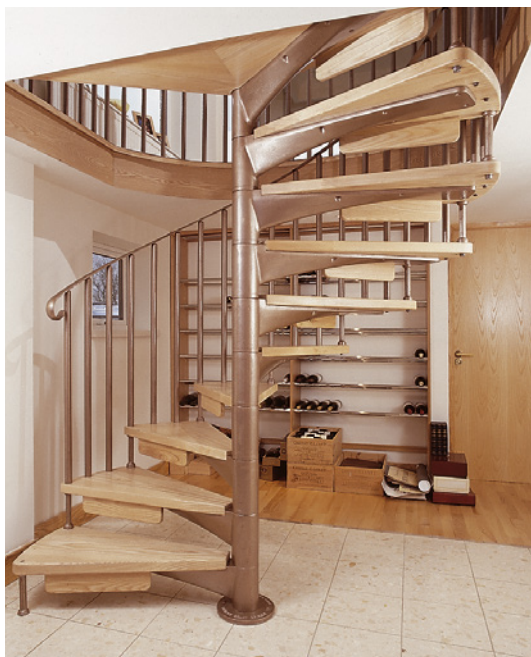
Scandinavian Spiral with Metal Handrail and Timber Riser Bars