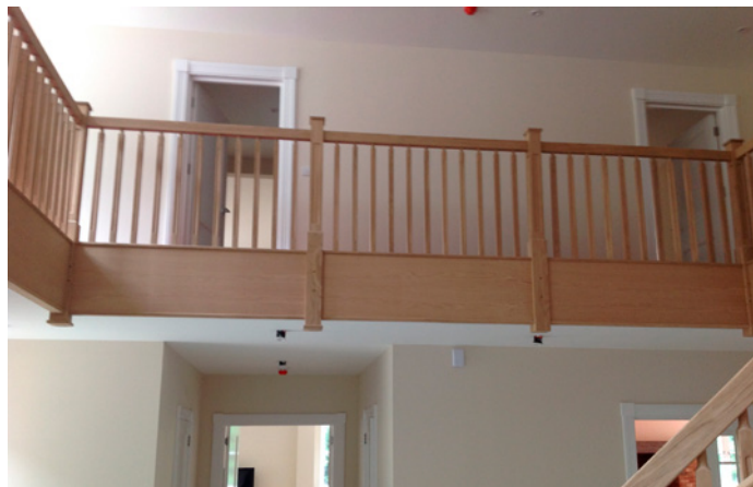
Fascias can also be supplied to finish the look