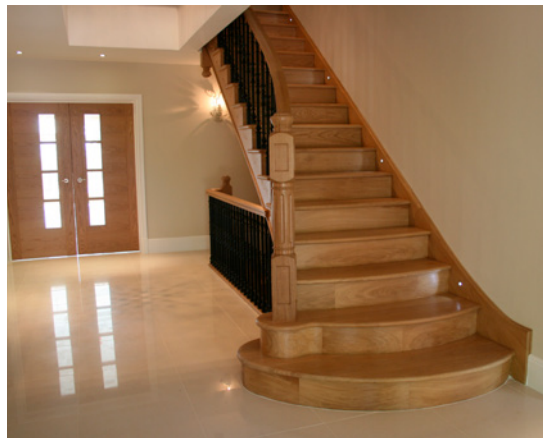
Sweeping Staircase with Bullnose Bottom Tread