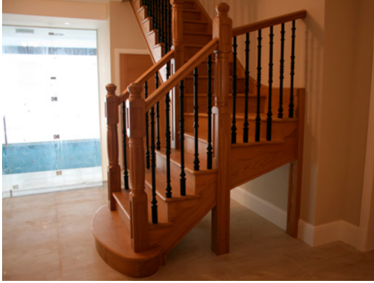
Kited Staircase with individually designed Chunky Newel Posts and Cast Balusters