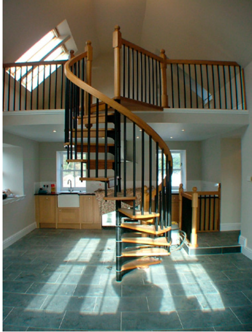
Scandinavian Spiral with Wooden Handrail and matching Landing Balustrade