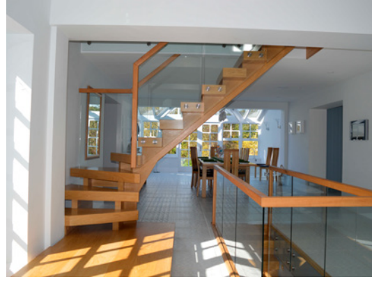
Oak Staircase with Glass Balustrade