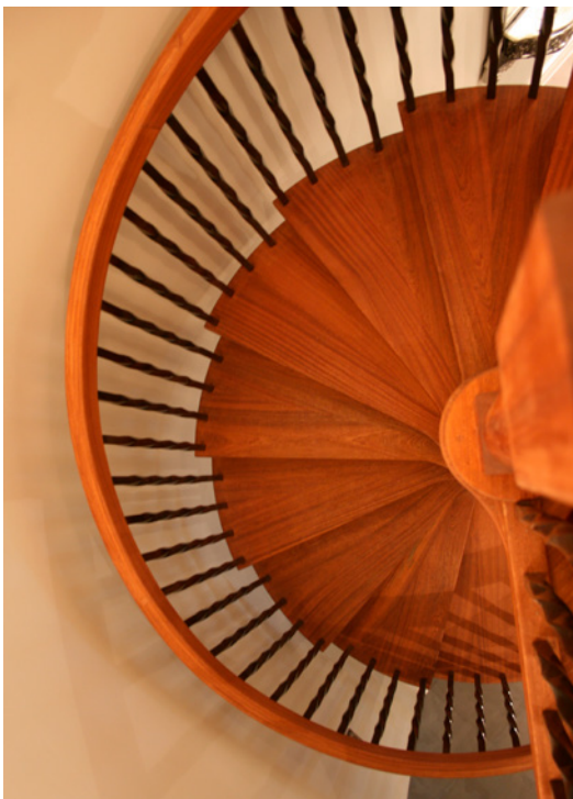
Sapele Spiral Stair with Loose Twisted Balusters