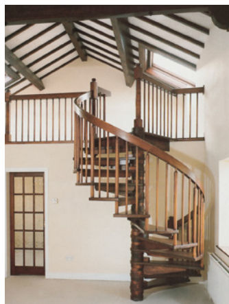
Sapele Spiral with Ribbed Centre Column and Plain Balusters