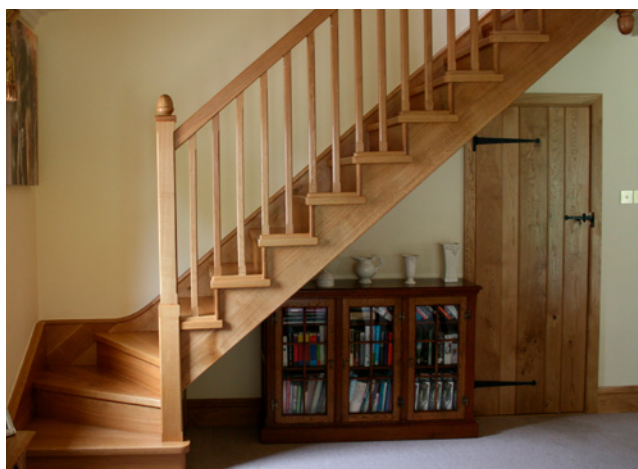
Kited Staircase with Square Chamfered Balusters and Acorn Top Newel Post