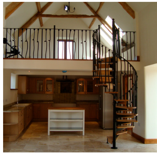
Scandinavian Spiral with Knotted Balusters