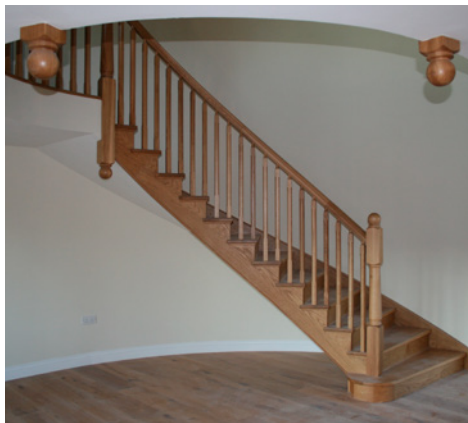
Helical Staircase with Square Chamfered Balusters