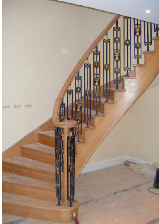
Oak Helical Staircase with Cast Balusters