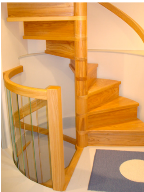
Burke Style Spiral with Glass Panel Landing Balustrade