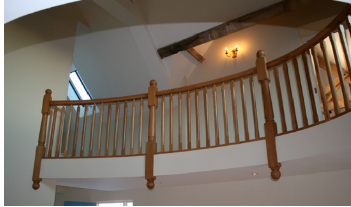
Landing Balustrade to match the design of any staircase