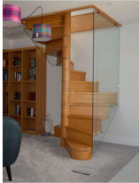
Oak Burke Style Squarial with Full Height Glass Balustrade