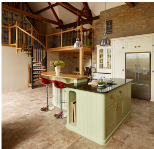
Scandinavian Spiral with Wooden Handrail

There are many cheaper alternatives of this design of spiral available available on the internet but the quality of staircase provided by ourselves cannot be compared with the cheaper box kits available.