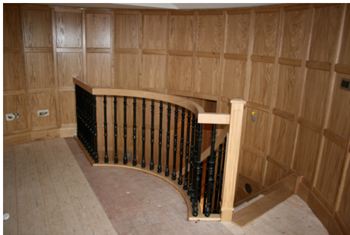
Landing Balustrade can be made to follow the curve of the staircase