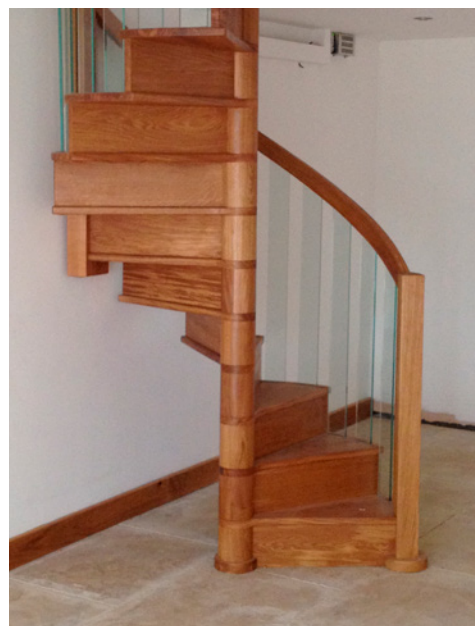
Burke Style Spiral with Glass Panel Balustrade