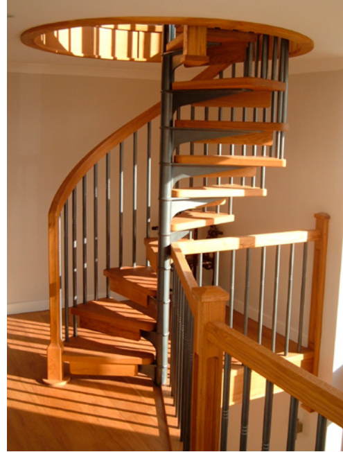
Scandinavian Spiral with Wooden Handrail