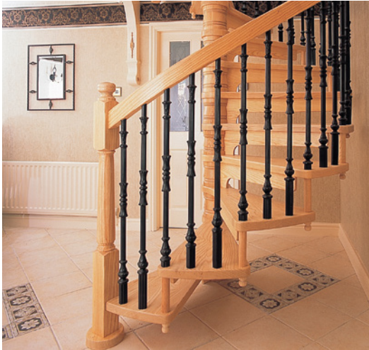
Solid Timber Spiral with Victorian Cast Balusters