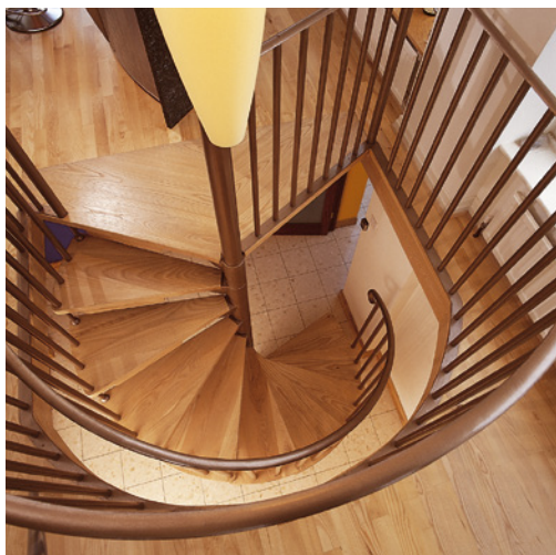
Scandinavian Spiral with Metal Handrail