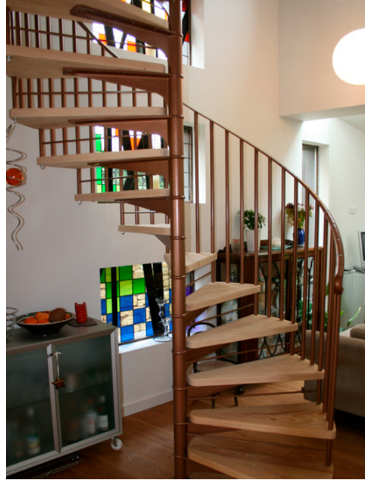
Scandinavian Spiral with Metal Handrail and Steel Riser Bars