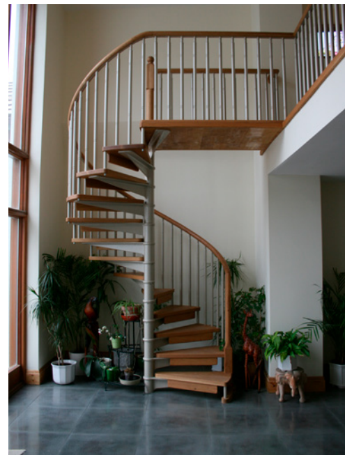
Scandinavian Spiral with Continuous Wooden Handrail